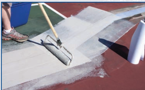
RiteWay Crack Repair System: Laying down micro sealant tape and stress mat.

No Hollow-Sounding Areas. No Dead Spots. No Bubbling. A True Bounce. Guaranteed.